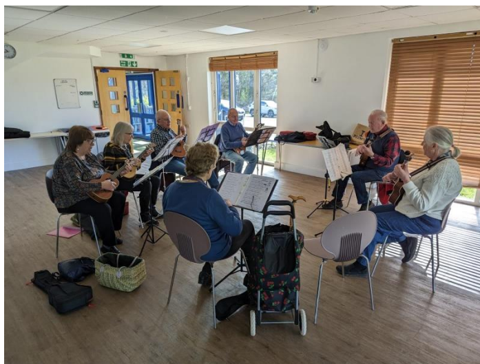
Pictured: Our Ukulele group practicing at the Woolwell Centre.

Are you retired or semi-retired? Do you now have spare time and wonder how to fill it? Would you like to meet new people and do new things? If you have answered yes, why not join a u3a? We meet at the Woolwell Centre at 2.30pm on the second Friday of the month. Please note, in August we do not meet, it's our summer break.