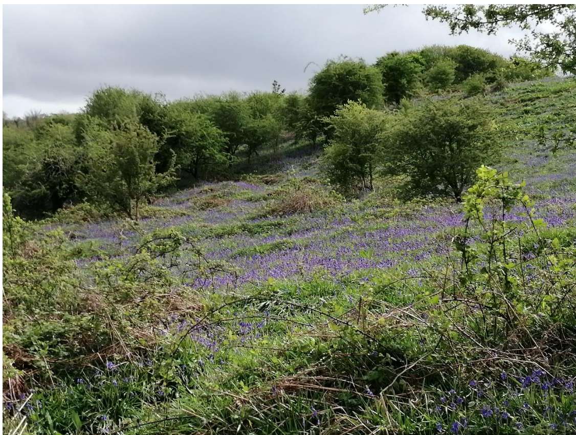
Bluebells in bloom on Knowle Down, Walkhampton

A pre paid funeral plan with Golden Charter gives you and your family peace of mind with a wide range of plans to suit all budgets from just £1950 . Your plan will be allocated to Morris Bros here in Tavistock. We also offer bespoke plans to suit specific requests. Contact us for further details or to make an appointment.