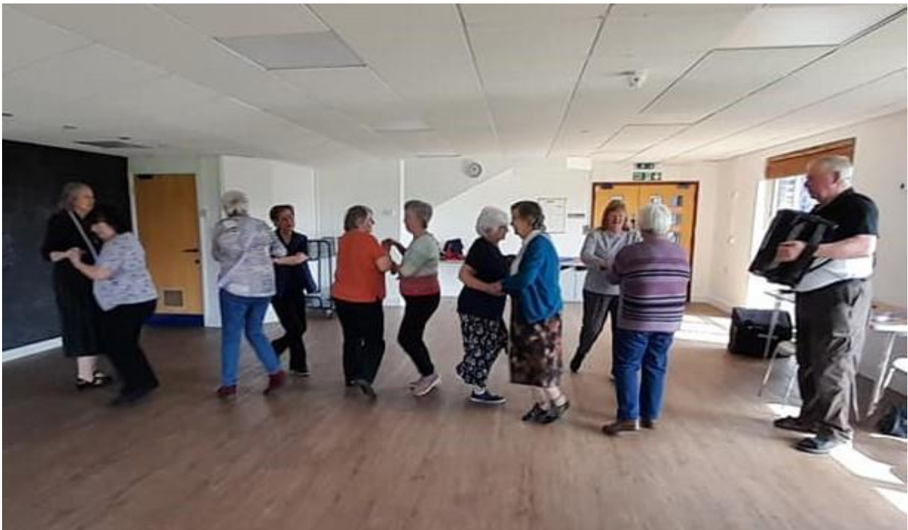
The Country Dancing Group in action