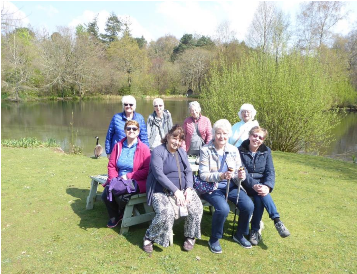
The Garden Visit group in front of the lake at Pinetum Gardens near St Austell.