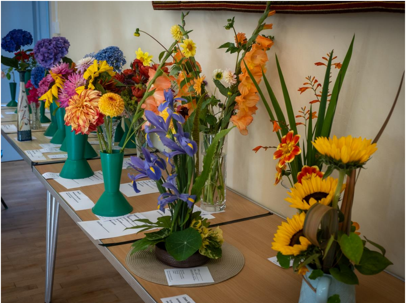
Walkhampton Flower Show – see page 4