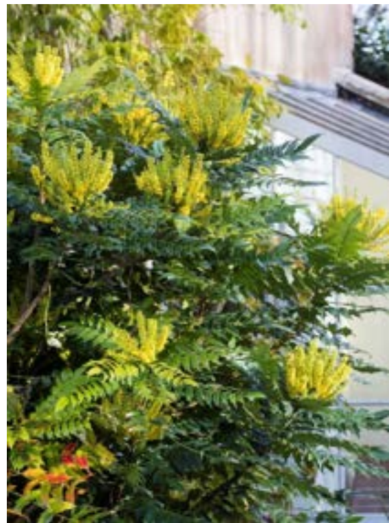
Mahonia x media Lionel Fortescue