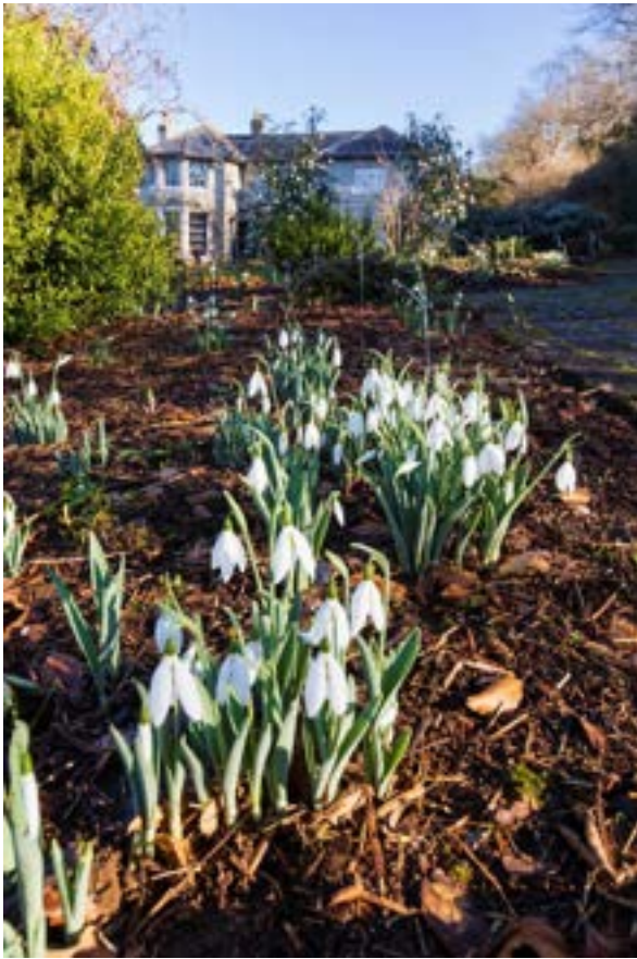
Garden House Snowdrops