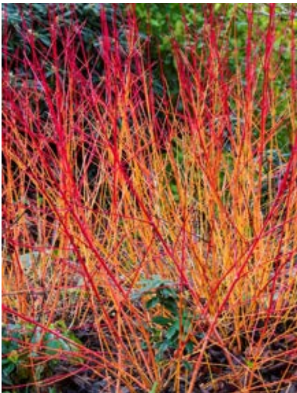
Cornus Sibirica Amy's Winter Orange