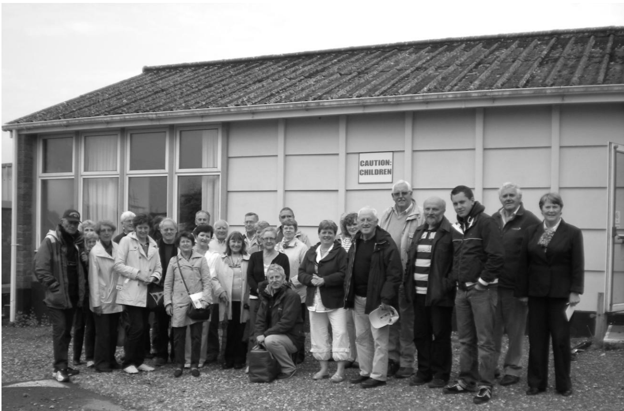
Burrator – Mathieu Twinning Visit A Group Photo outside Walkhampton Memorial Hall